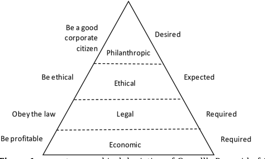
Figure 1 presents a graphical depiction of Carroll's Pyramid of CSR.

The four-stage pattern of CSR as presented by [37] as summarised by [39] is "Economic (jobs, wages and salaries), legal (legal compliance and playing by the rules of the game), ethical (being moral and doing what is just, right and fair), and discretionary responsibility (optional philanthropic contributions)". Though the ethical responsibility is depicted in the pyramid as a separate category of CSR, it should also be seen as a factor which cuts through and saturates the entire pyramid [4].